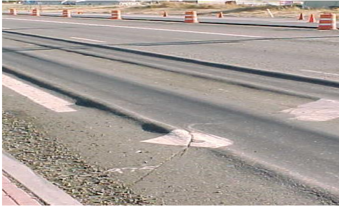
Pavement rutting – partially automated vehicle make it worse!