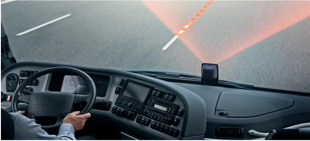
Lane Keeping Assist system