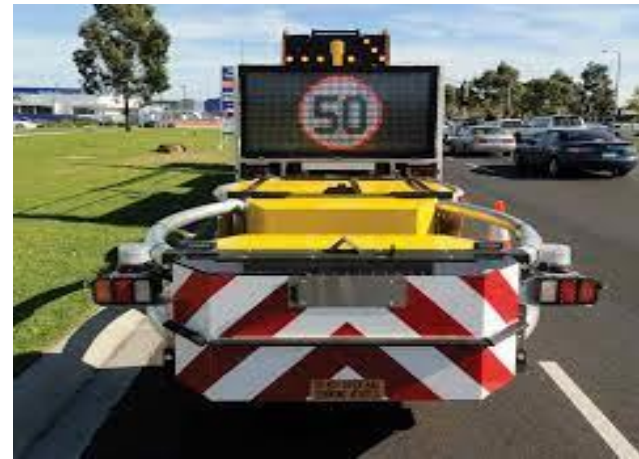
A truck mounted with an attenuator