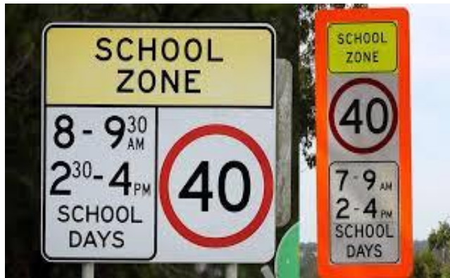
A speed limit for certain time and specific area