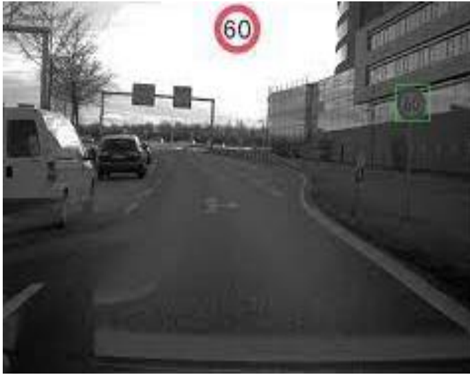
Traffic Sign Recognition System