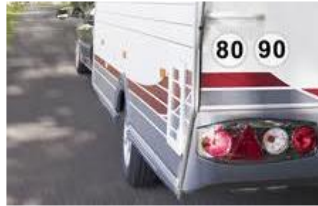
A vehicle with speed limit signs