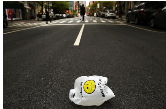
A moving plastic bag