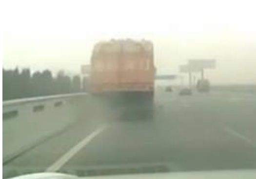
A telsa crashed into a cleaning truck, South China, 2016