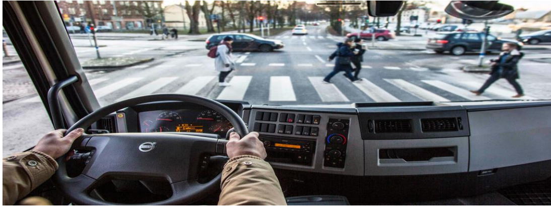
Forward Collision Warning System