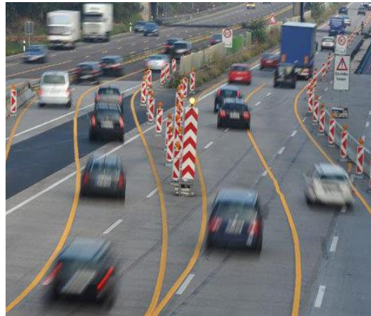
Temporary lane marks