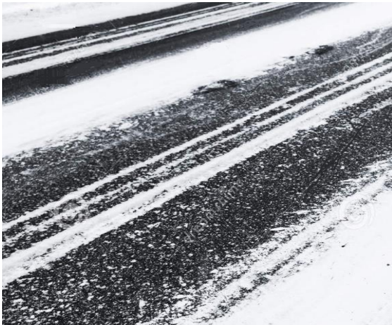
Lane marks covered by snow