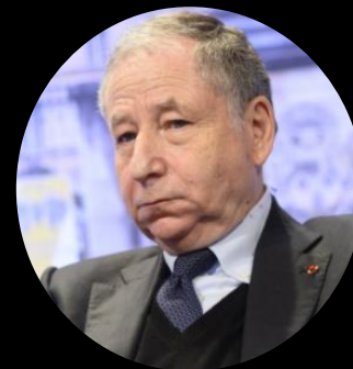
Jean Todt UN Secretary General's Special Envoy For Road Safety | President FIA