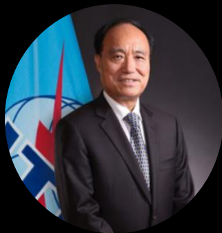
Houlin Zhao Secretary-General ITU